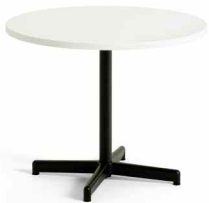
Round Table Laminate surface Black painted column and X base

Universal Tables are a great way to complete any setting—from conference rooms, training areas and café settings to individual workspaces. With a clean, simple aesthetic, Universal Tables are fully compatible with U-Free desks and Universal Worksurfaces.