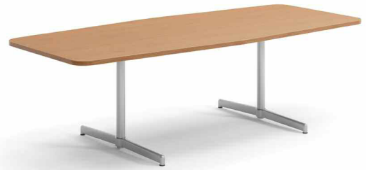
Hex Conference Table Woodgrain laminate surface with matching edge Platinum painted columns and T bases