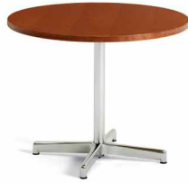
Round Table Veneer surface Polished chrome column and X base