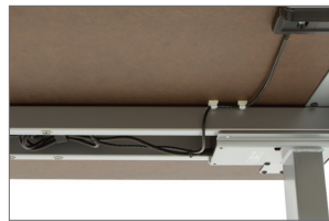
Cable ties and clips are included to manage the desk cords.