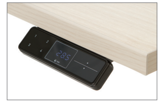
Programmable User Interface