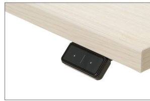
Intuitive User Interface